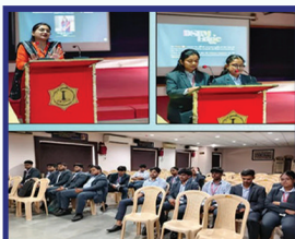
Arthavani: Finance Club