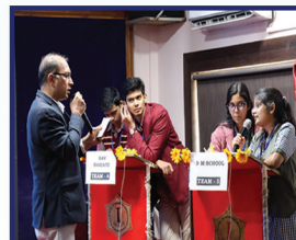
InQUIZitive: Quiz Club