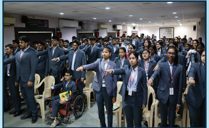
Learning Beyond Books