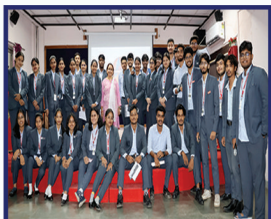
Avinyojit: Entrepreneurship Club