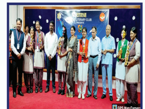
Vettrtva: Literary Club