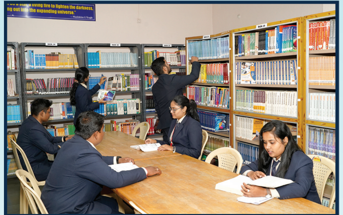
Knowledge Resource Centre